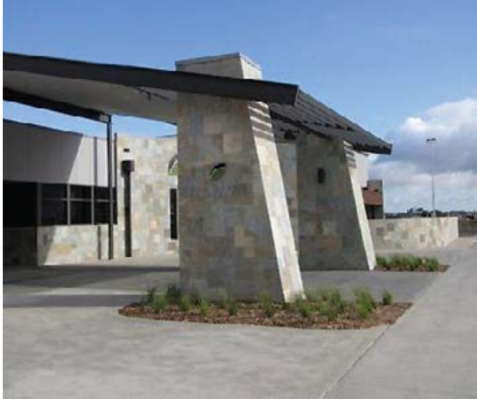
Cobb & Co [The Garden Company, Point Cook Community Centre VIC]