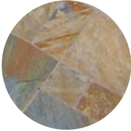
Cobb &amp; Co