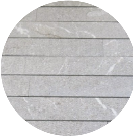
Sancerre (Hand Chiseled)